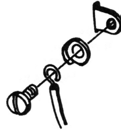
Figure 2 O18 Electrical Terminals

The cup washers furnished with the O18 are to be used when the conductor wires are directly connected to the terminals. The stripped end of the conductor should be made into a clockwise formed eye with an inside diameter to slip over the shank of the terminal screw. The clockwise forming will tend to wrap the eye of the conductor around the screw shank as it is being tightened. The cup washer, with its flanges outward, should be placed between the terminal and the screw head to capture the eye of the conductor.